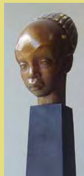
"Mangbetu Child: Bronze Cast #2" by Viktor Schreckengost