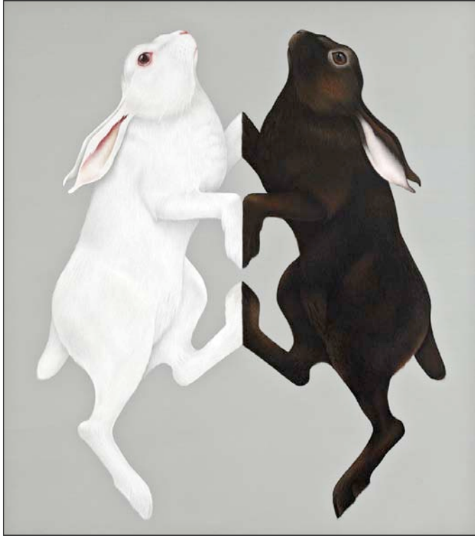
"Premonition", gouache. By Melissa Bland, Waltham, MA

Attleboro Arts Museum 86 Park Street Attleboro, MA 02703 508.222.2644 www.attleboroartsmuseum.org